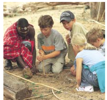
Meeting Masai children