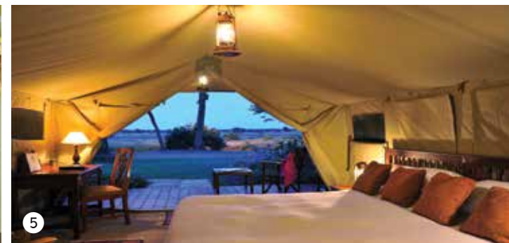
1. Nairobi Serena Hotel 2. Mara Serena Lodge 3. Zanzibar Serena Inn 4. Mara Serena Lodge 5. Sweetwaters Tented Camp