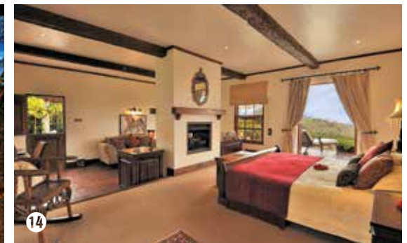
6. Pioneer Camp 7. Mara Intrepids Camp 8. Migrations Camp 9. Mara Explorer Camp 10. Samburu Intrepids Camp 11. Mara Intrepids Camp 12. Great Rift Valley Lodge 13. Sand River Camp 14. The Manor